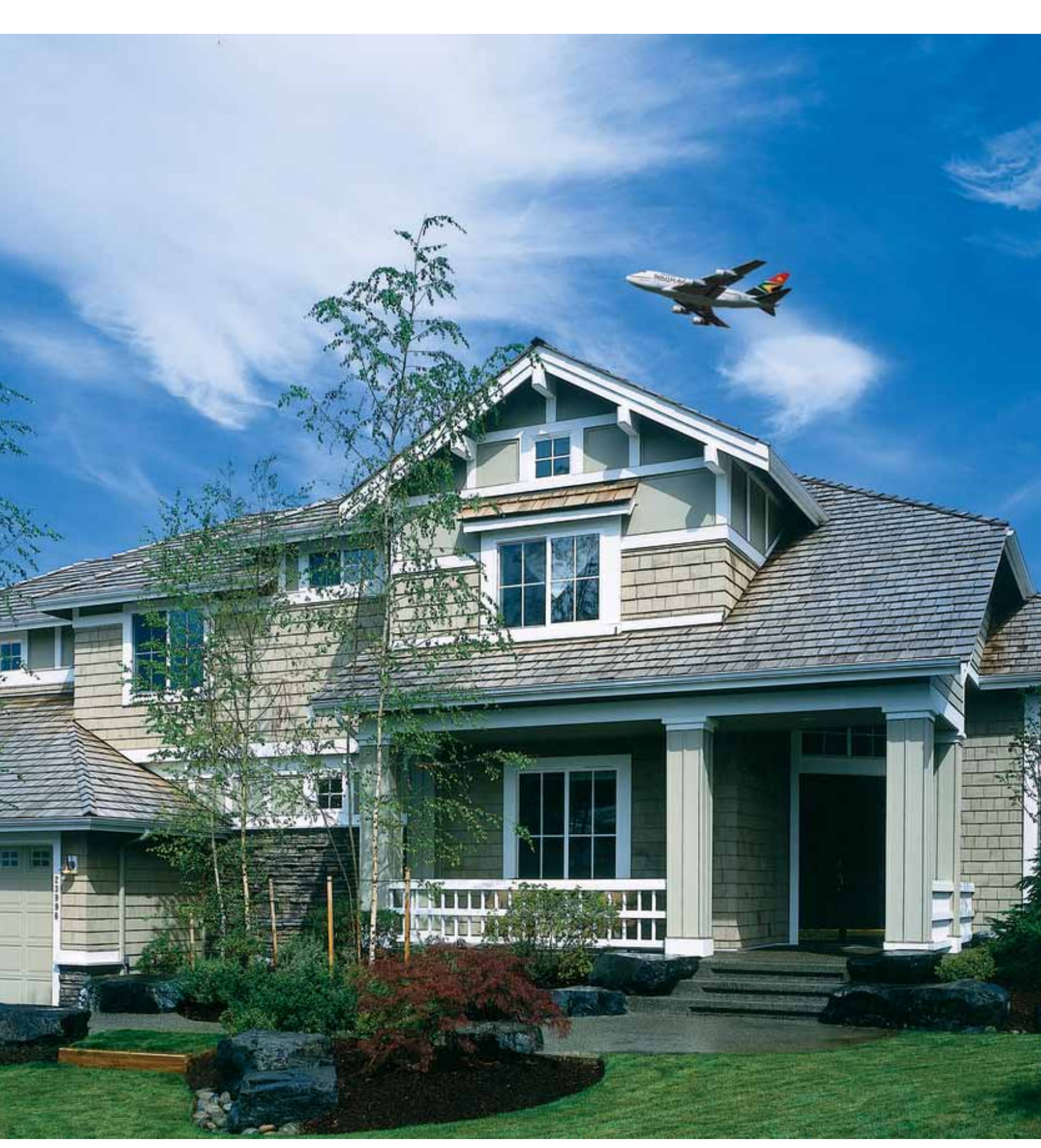
1.800.MILGARD · milgard.com